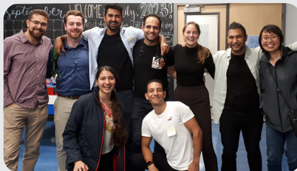
Dalhousie Franco Doc group 2019-2020

In September 2019, Réseau Santé became the co-resource organization for the national Franco-santé project with the Réseau santé en français de TNL. After several months of planning, Réseau Santé will help health networks across the country to implement this project. Like Franco Doc, the project seeks to identify and support francophone students enrolled in English-language health programs.